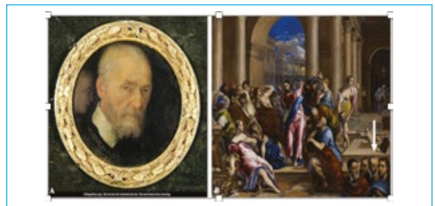
Figure 2: A- Giulio Clovio self-portrait (1573) Uffizi Gallery, Florence, Italy (inv# 4213 – 1890). Source: Wikimedia: https://www.wikigallery.org/wiki/painting_170613/Giorgio-Giulio-Clovio/Self-Portrait . Copyright expired; B- Christ Driving the Money Changers from the Temple (El Greco, ca. 1570-75) Clovio is represented in the lower right corner (white arrow), Institute of Arts in Minneapolis, USA (inv #522). Source: Wikimedia: https://en.wikipedia.org/wiki/Christ_Driving_the_Money_Changers_from_the_Temple_(El_Greco,_Minneapolis)#/media/File:El_Greco_(Domenikos_Theotokopoulos)_Christ_Driving_the_Money_Changers_from_the_Temple_-_Google_Art_Project.jpg

nose, clinical signs suggestive of rosacea. Also, there are obvious red and thickened eyelid edges, especially of the lower eyelid, and they also look uneven. These ocular signs are even more evident on the famous Clovio portrait painted by El Greco in 1570/71 (Figure 1). Beside the already described redness of the nose and the face, red, thickened and uneven eyelid edges are clearly visible. Furthermore, on the lower eyelids the edge is twisted out. The upper eyelid of the left eye is completely uneven and slightly showing old scarring changes, maybe due to the alteration of the eyelid morphology caused by recurrent blepharitis.